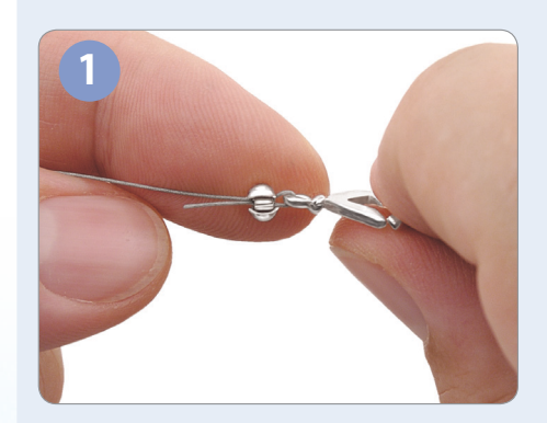
Place the Crimp Cover over the exposed, already crimped Crimp Bead/Tube.