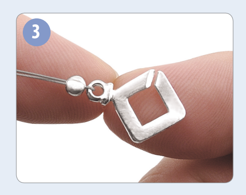
Once securely closed, Crimp Covers provide an ultrasmooth, clean finish.